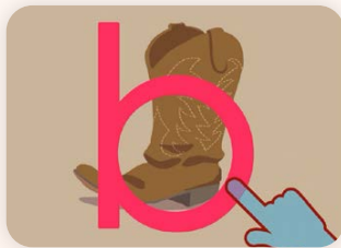
● Letters and Sounds