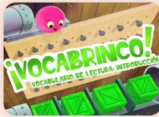
● Literacy Support