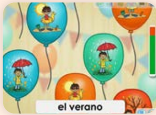
● Vocabulary Acquisition