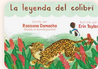
● Authentic Literature

Contact your sales rep to learn more about gaining early access to Imagine Español 3–5.