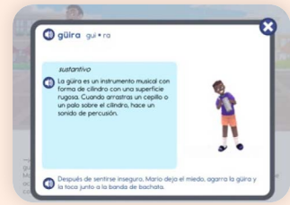
● Language Functions