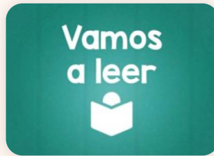
● Reading Fluency