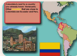
● Accent Modeling