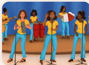
● Arts and Music