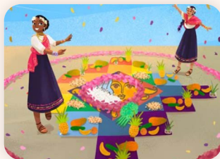
● Cultural Highlights