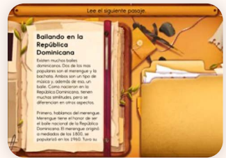
● Reading Comprehension