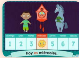
● Engaging Practice